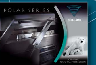
OTHER ORIGINAL HENKELMAN SERIES